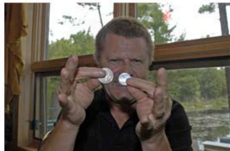
Coins, string and some island pocket magic.